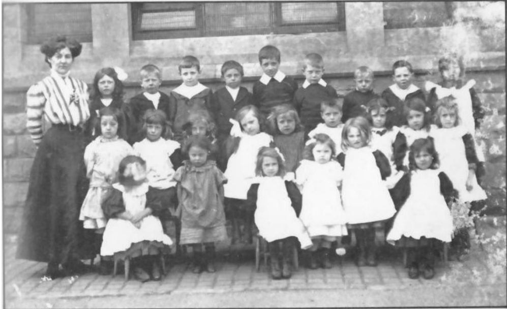
Above: Harthill Infants 1910.