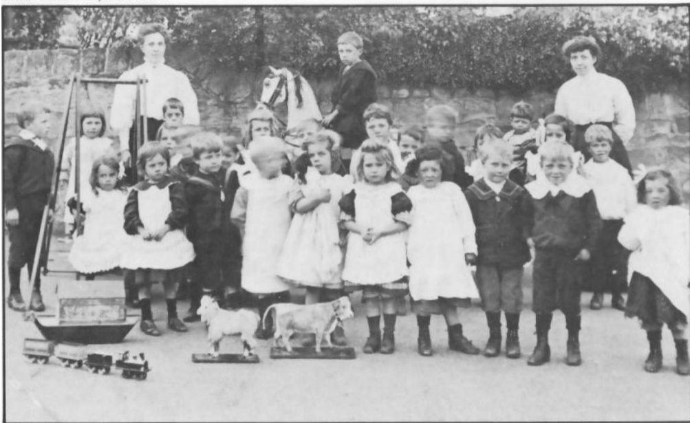
Below: Harthill Infants 1909.