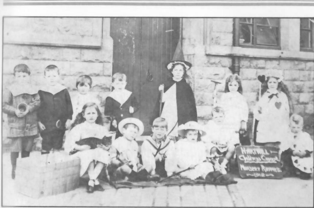
Above: No. 6 "Nursery Rhymes".