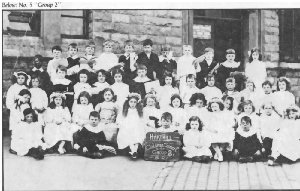
Below: No. 5 "Group 2".