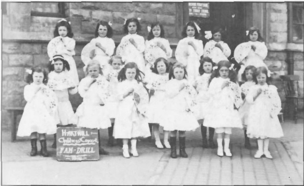
Below: No. 3 "Fan-Drill".