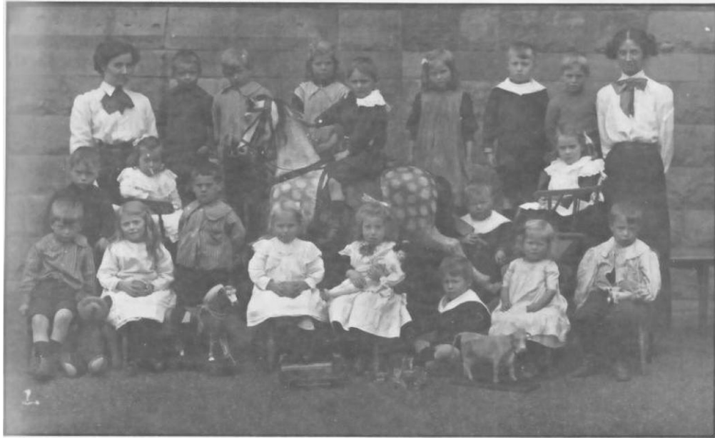
Below: Harthill School Infants, date unknown.