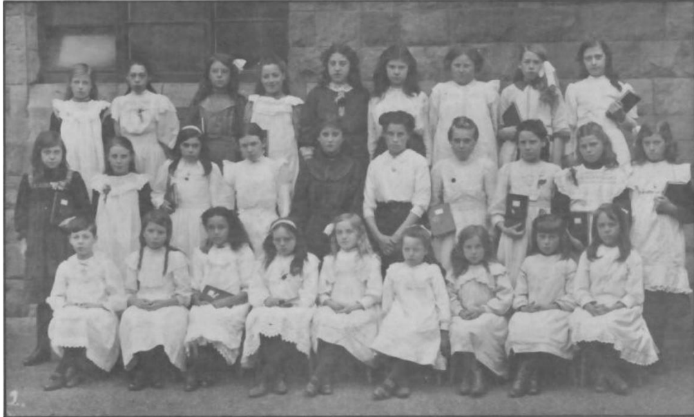
Above: Harthill schoolgirls circa 1912.

Below The next six pictures were taken at the Harthill children's concert in 1912. No 1 shows "The Birthday Party