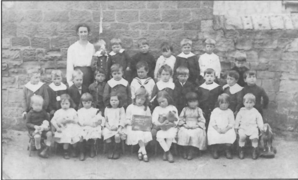
Above: Harthill Infants. 1919.

Below: Harthill schoolchildren at the turn of the century.