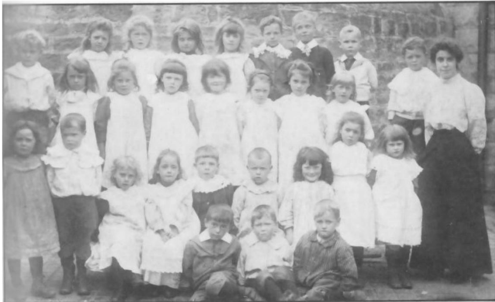
Above: A mixed class, photographed in the early 1900's.

Below: A mixed class, photographed in the early 1900's