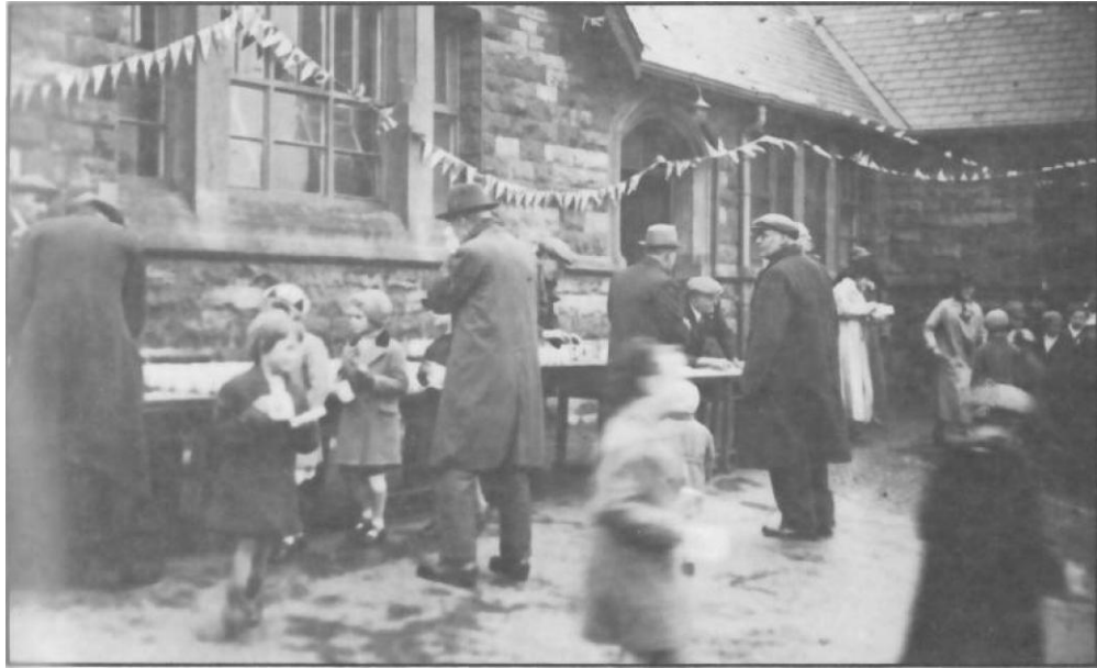
Above: Mug presentation outside the school to celebrate King George V's jubilee.