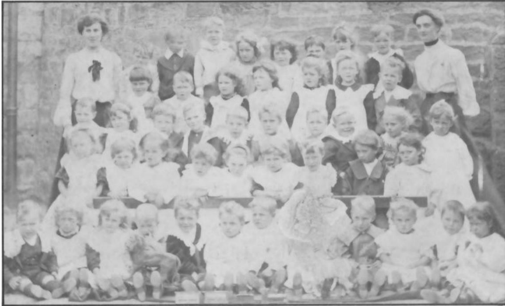
Above: Harthill Infants circa 1900.