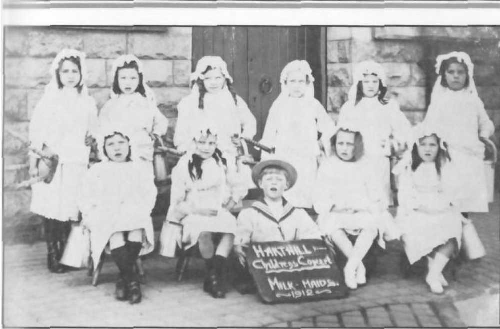
Above: No. 2 "Milk Maids".