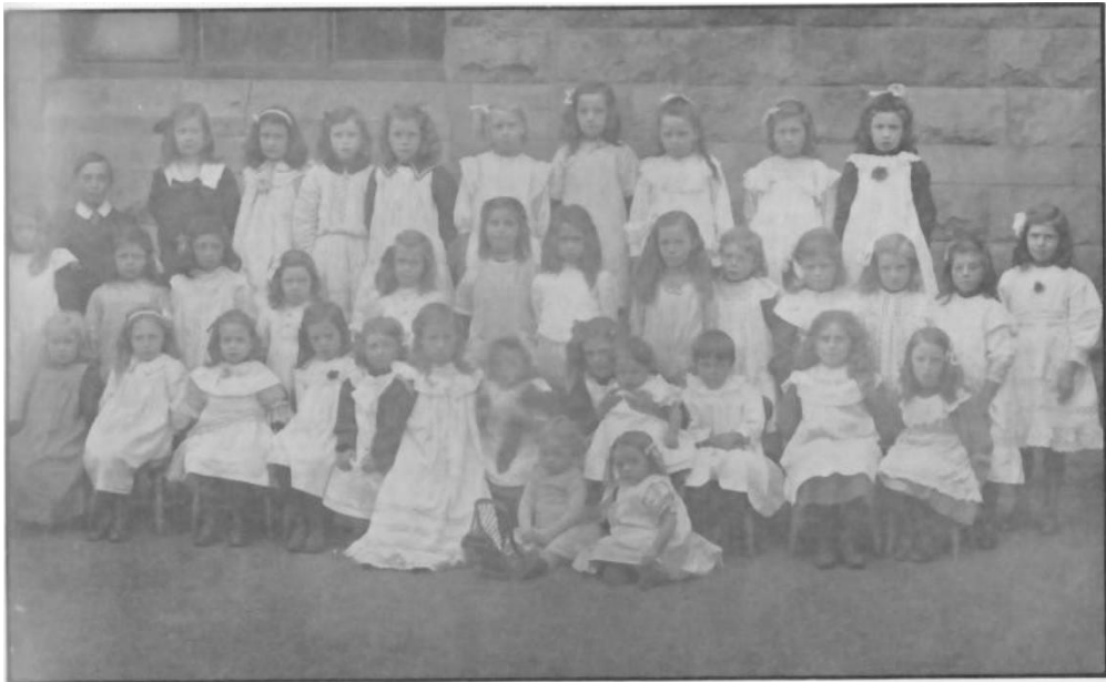
Below: Harthill schoolchildren early 1900.