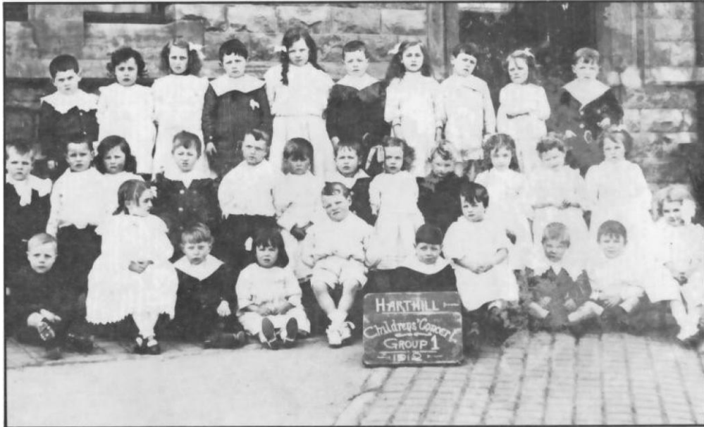
Above: No. 4 "Group 1".